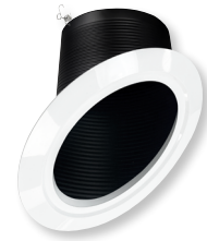
NTM-617/45B Black Baffle / White Flange