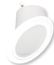
NTM-617/45W White Baffle / White Flange