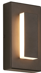
ASPEN 8 shown in bronze