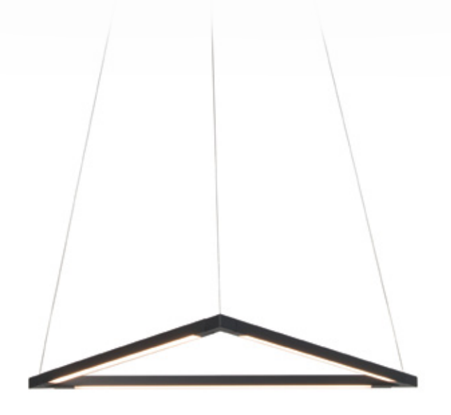
triangle with 16" light bars