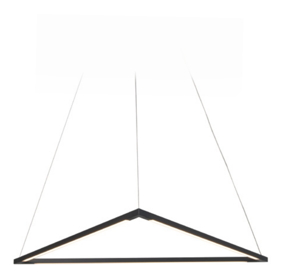
triangle with 24" light bars