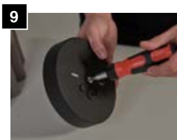
9 Same as Step 8.