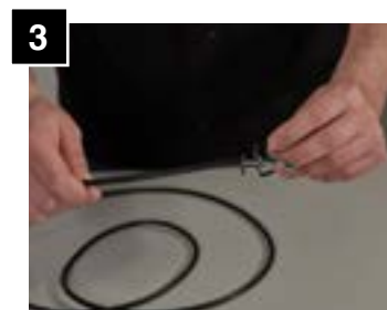
3 Feed lock washer and nut/balancer through cord.