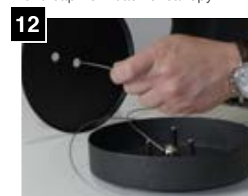
12 Feed aircraft cable through backside center hole of canopy cover.