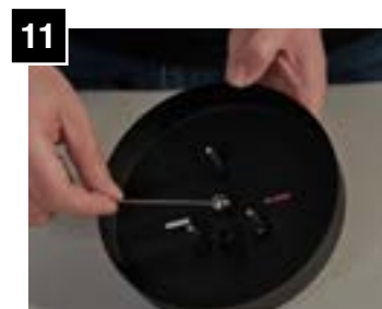
11 Same as Step 10.