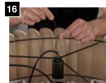
16 Continue to feed aircraft through remaining opening of strain relief.