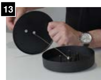
13 Same as Step 12.