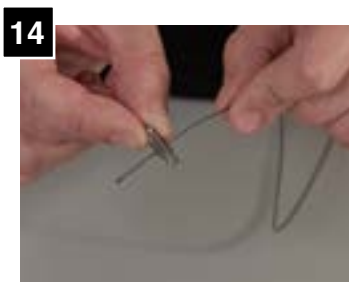
14 Pass aircraft cable through one hole of strain relief.