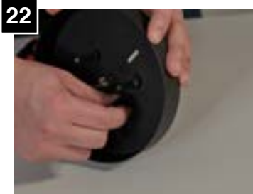
22 Same as step 21.