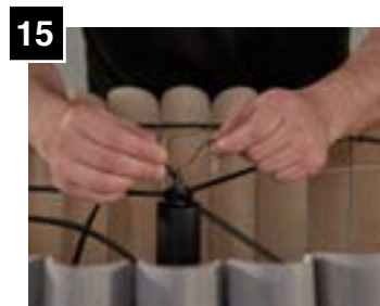
15 Loop same end of aircraft cable through balancer.