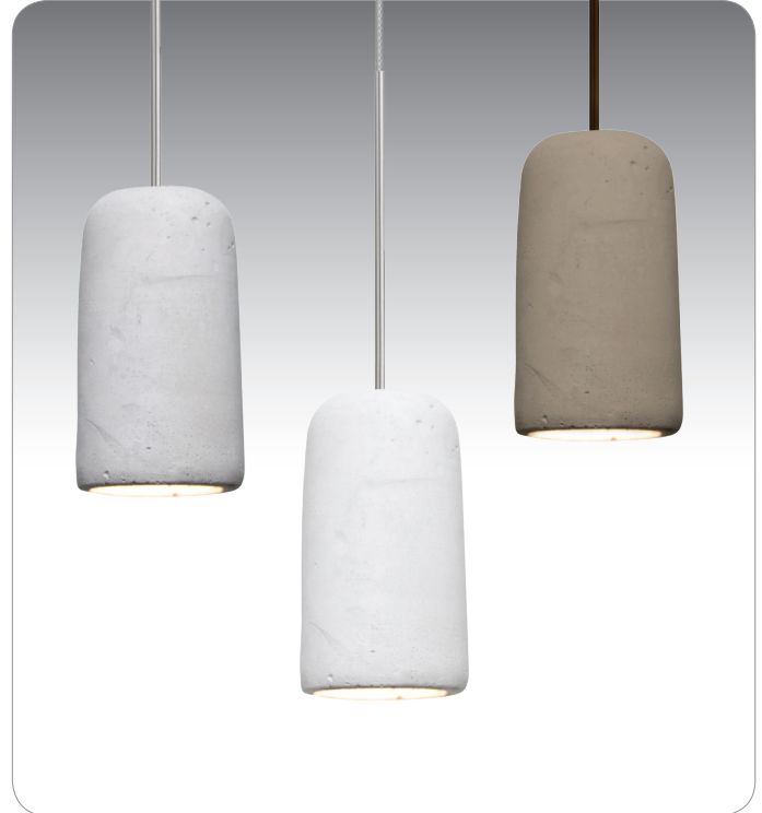
NATURAL (GLIDENA), WHITE (GLIDEWH) & TAN (GLIDETN) WITH BRONZE FINISH

UL or ETL Listed. Suitable for Damp Locations (interior use only).