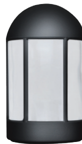
315157-FR Black with Frost option