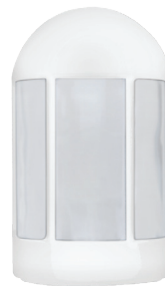
315153-FR White with Frost option