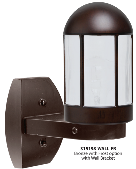
315198-WALL-FR Bronze with Frost option with Wall Bracket