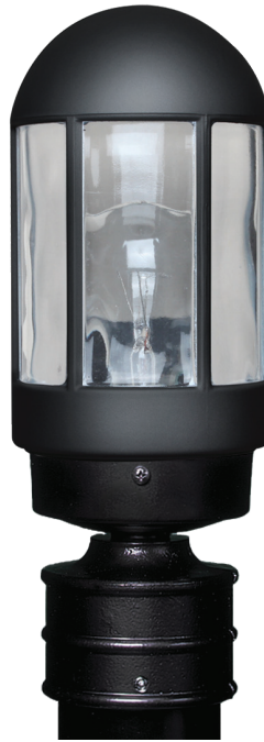
315157-POST Black with Post Fitter

UL or ETL Listed. Suitable for Wet Locations. May be used in Interior or Exterior applications.