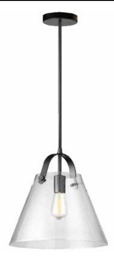
1 Light Incandescent Pendant Matte Black Finish with Clear Glass