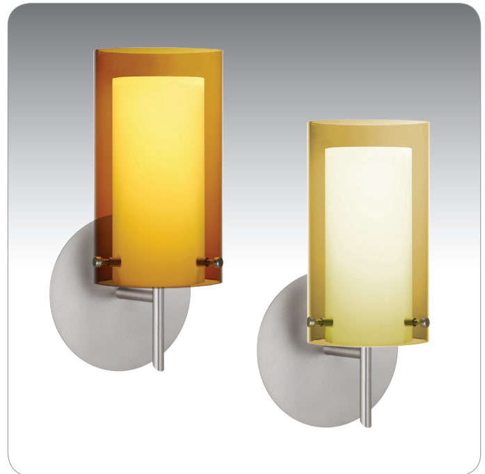
PAHU 4 SHOWN IN TRANS. ARMAGNAC/OPAL (A44007) & TRANS. GOLD/OPAL (Y44007)