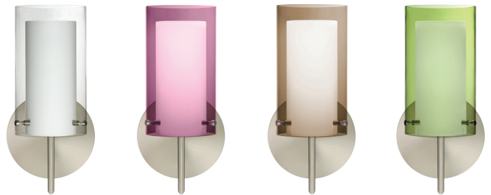
C44007 CLEAR/OPAL A44007 TRANS. AMETHYST/OPAL S44007 TRANS. SMOKE/OPAL L44007 TRANS. OLIVE/OPAL