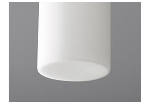
-2 Matte White Acrylic