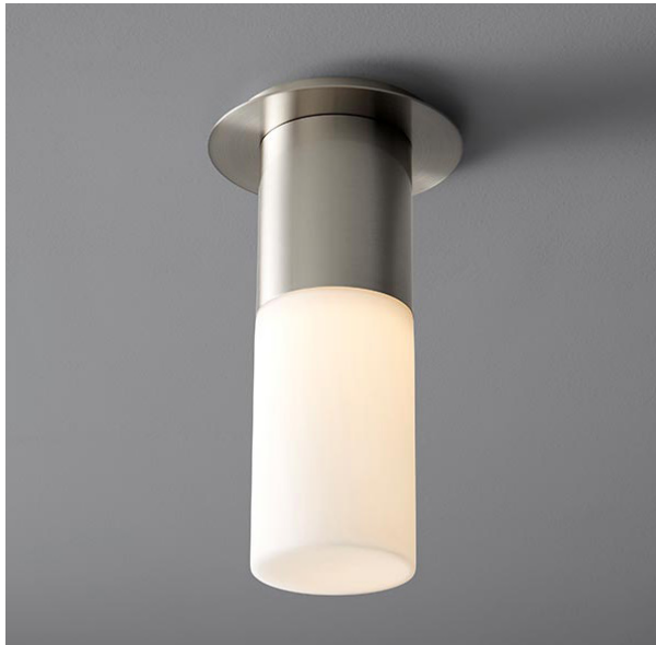
-20 Polished Nickel