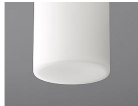
-1 White Opal Glass