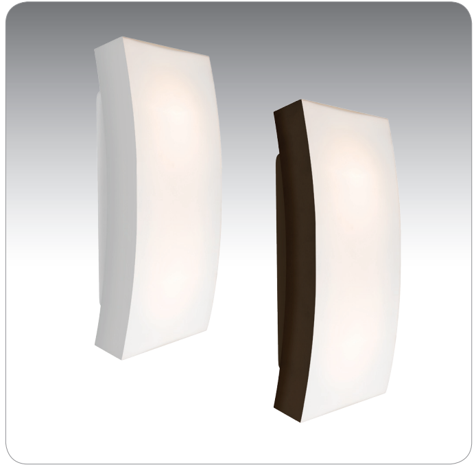
SHOWN IN OPAL MATTE/SILVER AND OPAL MATTE/BRONZE

UL or ETL Listed. Suitable for Wet Locations (interior or exterior use).