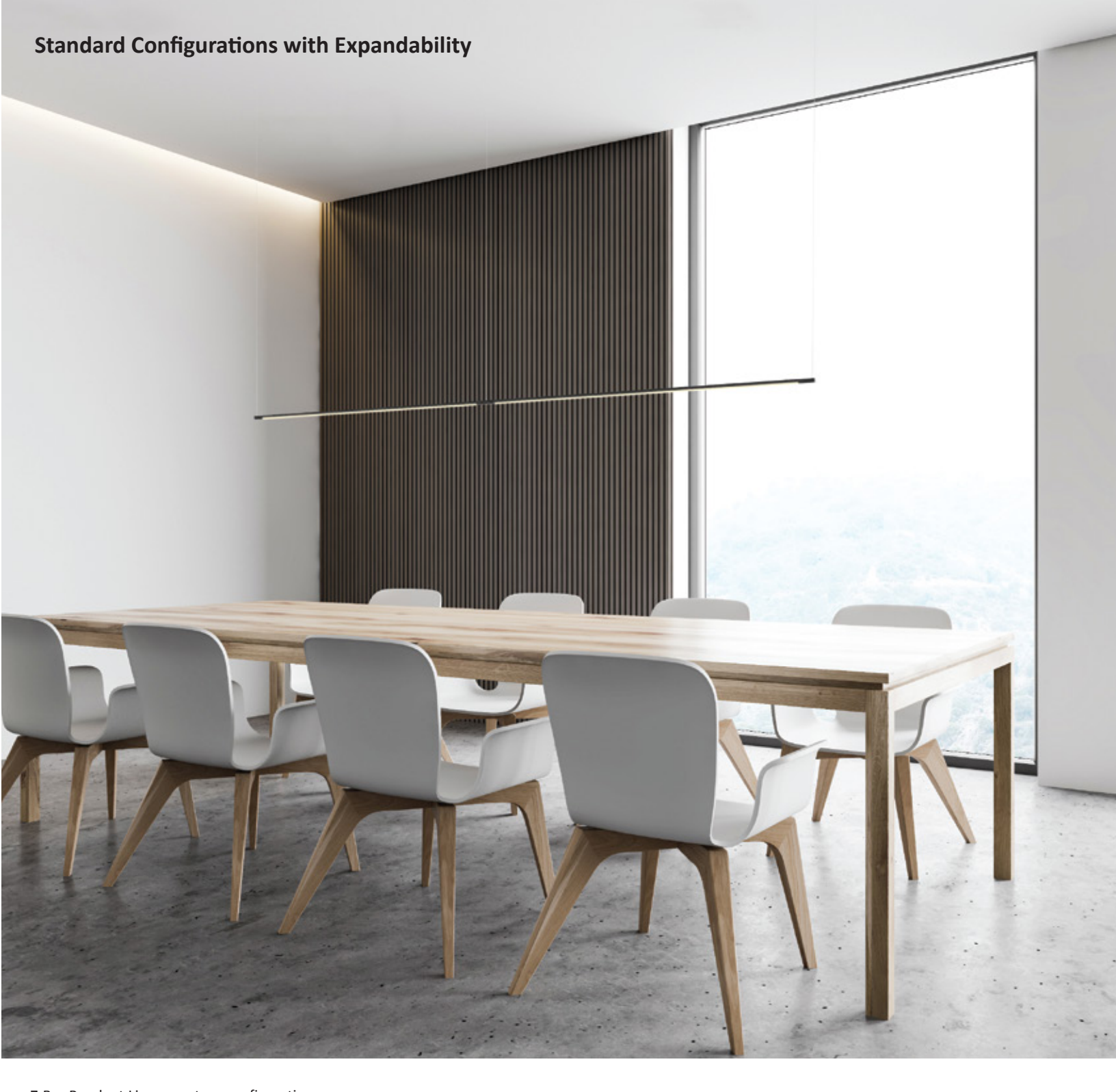
Z-Bar Pendant Linear custom configuration