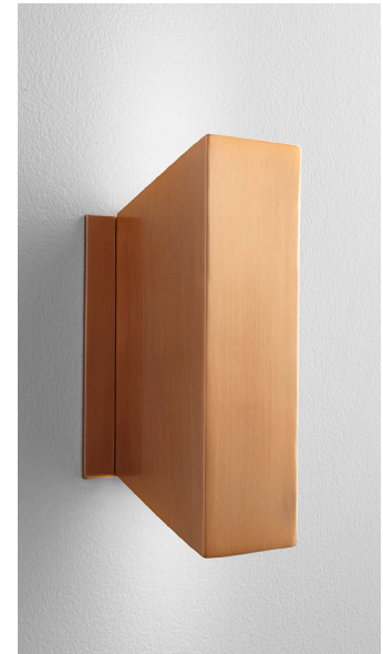
With optional backplate

LIGHT SOURCE 2 x 7W Max LED GU10 Base Socket (Lamp not included)