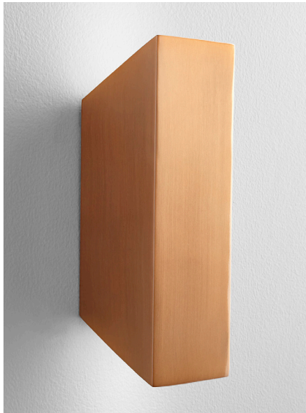
-25 Satin Copper