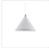
492824-WH/GD White with Gold detail