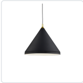
492824-BK/GD Black with Gold detail