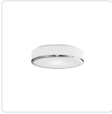
599002BN Brushed Nickel