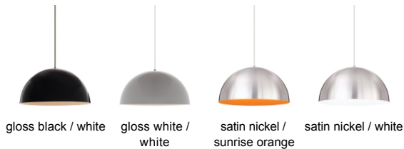
gloss black / white gloss white / white satin nickel / sunrise orange satin nickel / white