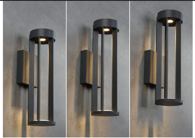
Integrated height adjustment system allows you to customize your fixture position. Low, Mid or High.