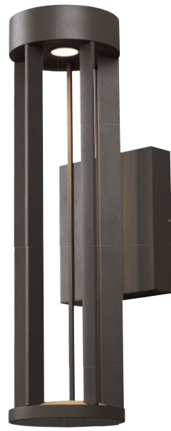
TURBO WALL shown in bronze