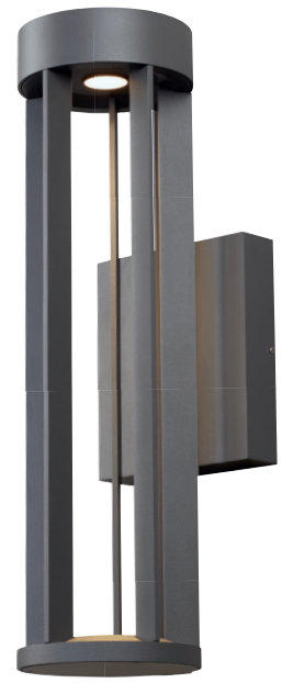
TURBO WALL shown in charcoal