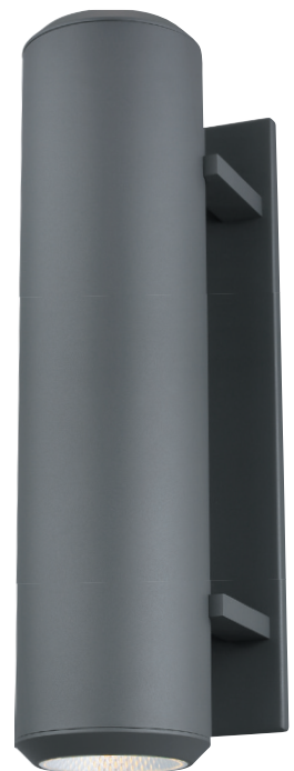
ASPENTI 20 shown in charcoal