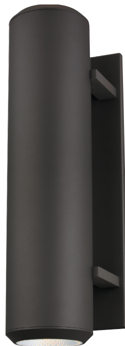
ASPENTI 20 shown in bronze

* Visit techlighting.com for specific warranty limitations and details.