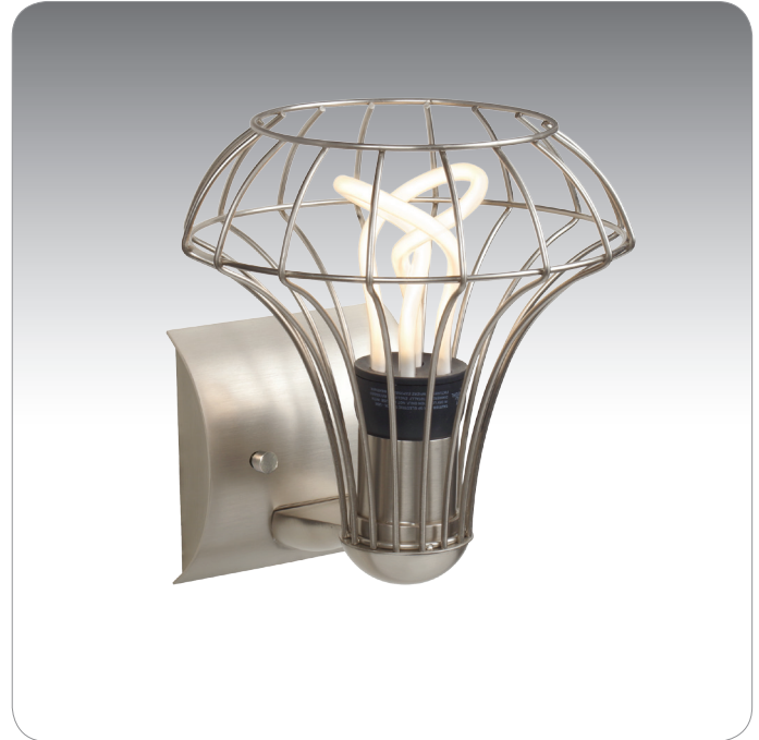
SPEZZA 7 SHOWN IN SATIN NICKEL WITH PLUMEN LAMP