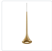
402601BG-LED Brushed Gold