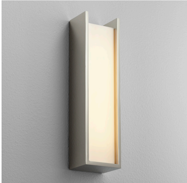
-20 Polished Nickel