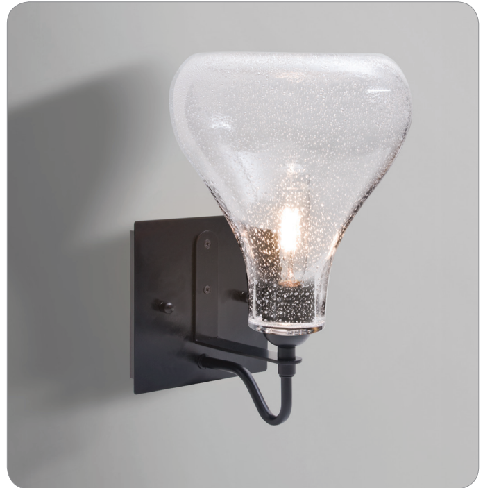
MELOCL (CLEAR BUBBLE)

UL or ETL Listed. Suitable for Damp Locations (interior use only).