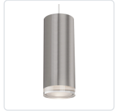
401432BN-LED Brushed Nickel