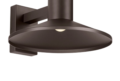
ASH 16 shown in charcoal/clear cylinder