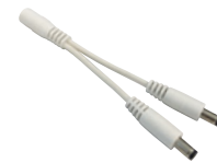
NATL-302W Power Line Splitter