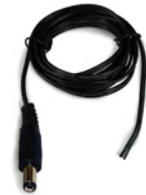
NALTL-10 / NALTL-30 Power Line Connector