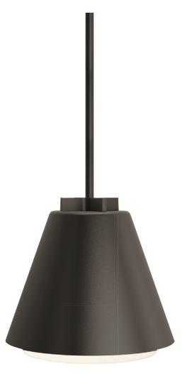
BOWMAN 12 PENDANT shown in bronze