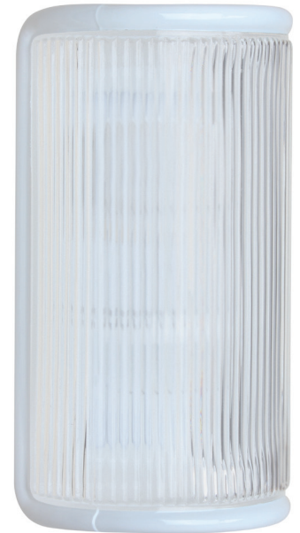
307953-FR White with Frost option