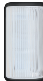
301957-FR Black with Frost option