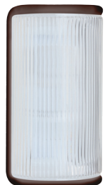
307998-FR Bronze with Frost option