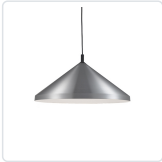
493126-BN/BK Brushed Nickel with Black detail