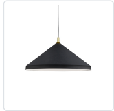
493126-BK/GD Black with Gold detail