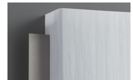
-6 Silver Cloth Acrylic