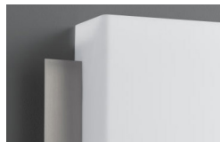
-2 Matte White Acrylic