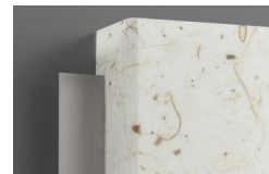
-3 Tobacco Acrylic