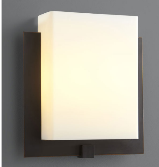
-95 Old World