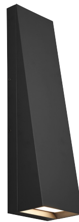
PITCH 19 shown in black