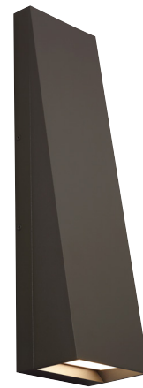
PITCH 19 shown in bronze