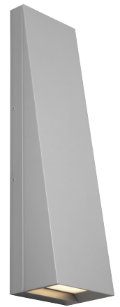
PITCH 19 shown in silver

*Visit techlighting.com for specific warranty limitations and details.