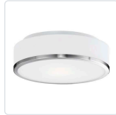
FM6012-BN-5CCT Brushed Nickel