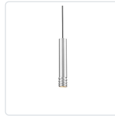
494502L-BN Brushed Nickel