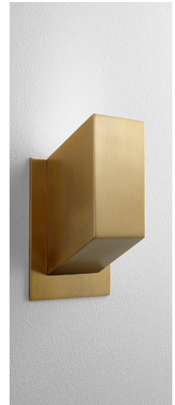
With optional backplate