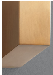
-25 Satin Copper