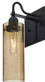
JUNI10PL PLUM BUBBLE