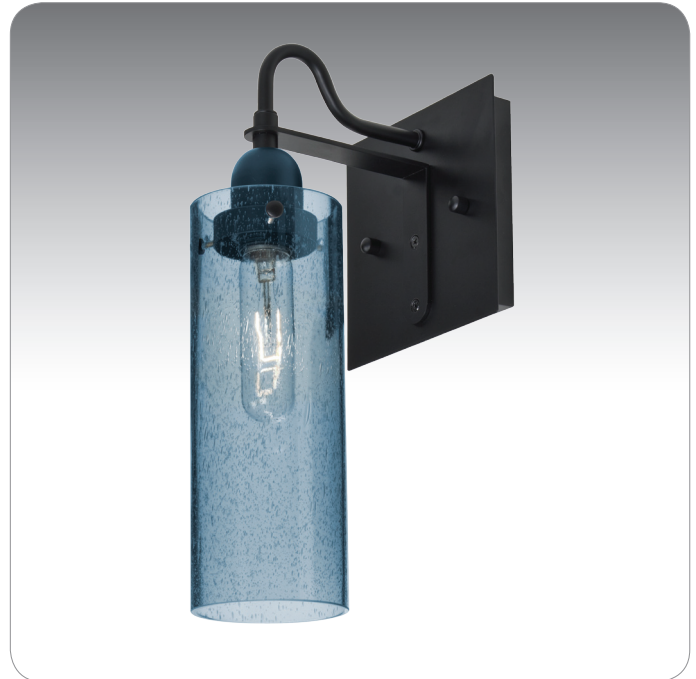
BLUE BUBBLE (JUNI10BL)

UL or ETL Listed. Suitable for Damp Locations (interior use only).