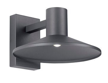
ASH 12 shown in charcoal/clear lens