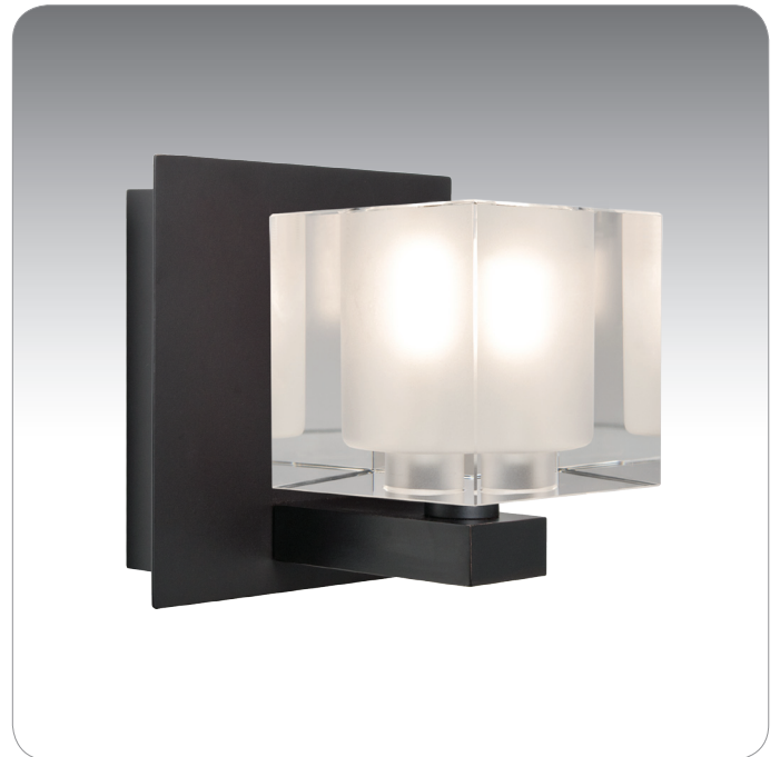
CLEAR/FROST (BOLOFR) IN BRONZE

UL or ETL Listed. Suitable for Damp Locations (interior use only).