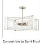
Convertible to Semi Flush