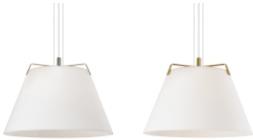
polished nickel / white