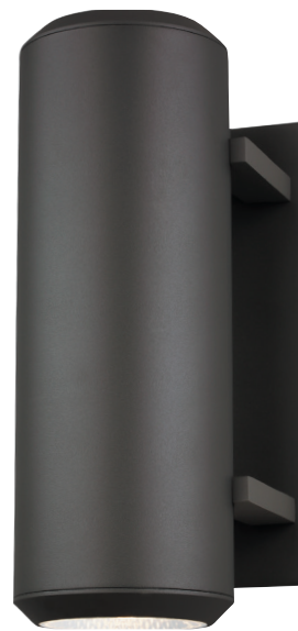
ASPENTI 14 shown in bronze

* Visit techlighting.com for specific warranty limitations and details.