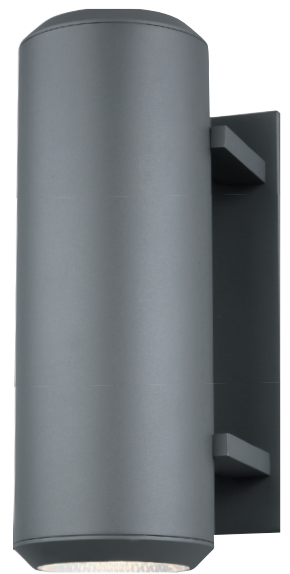
ASPENTI 14 shown in charcoal