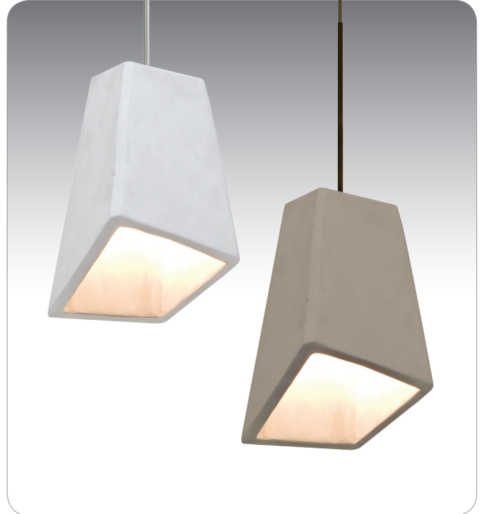
WHITE (SKIPWH) & TAN (SKIPTN) WITH BRONZE FINISH

UL or ETL Listed. Suitable for Damp Locations (interior use only).