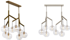
clear / aged brass