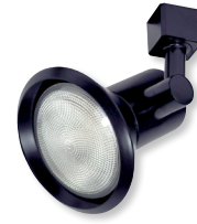
NTH-125B Black Cone