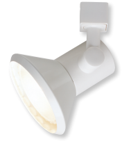
NTH-125W White Cone