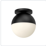
FM58310-BK/OP Black/Opal Glass