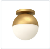
FM58310-BG/OP Brushed Gold/Opal Glass