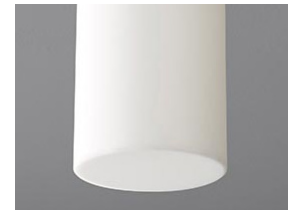
-2 Matte White Acrylic