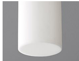
-1 White Opal Glass