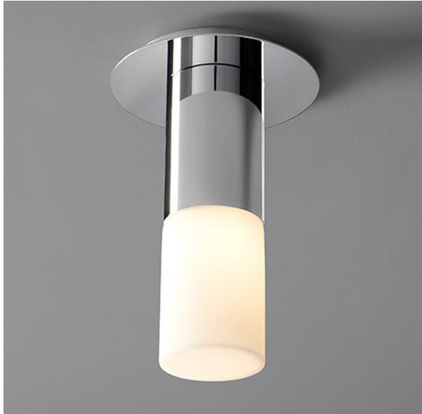
-20 Polished Nickel