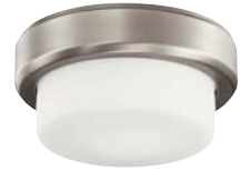
380046 AP Fluorescent