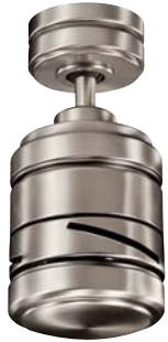
Antique Pewter 300146 AP

Fluorescent 380046 AP, OBB, PN, WH Etched Cased Opal Glass (1) 18-W, GU24, CFL Lamp, 3.48" H x 7.48" D, Lamp Included