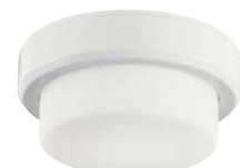
380046 WH Fluorescent