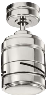
Polished Nickel 300146 PN