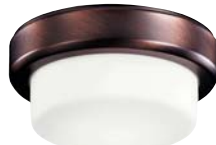
380046 OBB Fluorescent