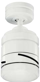
White 300146 WH