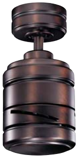
Oil Brushed Bronze™ 300146 OBB