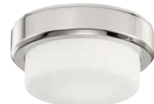
380046 PN Fluorescent