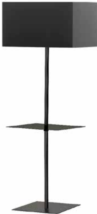
1 Light Incan Square Base with Square Shelf, Matte Black with Black Shade