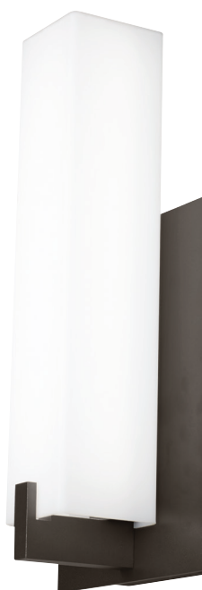
COSMO 18 shown in bronze

* Visit techlighting.com for specific warranty limitations and details.