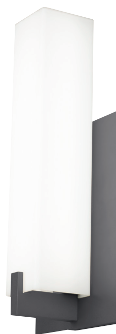
COSMO 18 shown in charcoal