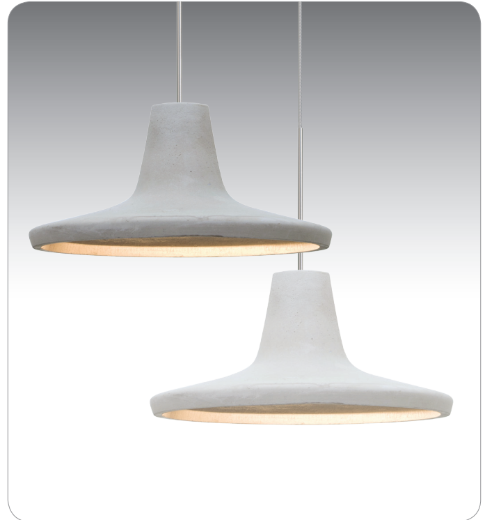
NATURAL (MODUSNA) & WHITE (MODUSWH)

UL or ETL Listed. Suitable for Damp Locations (interior use only).