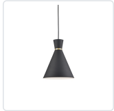
493210-BK/GD Black with Gold detail