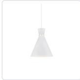
493210-WH/GD White with Gold detail