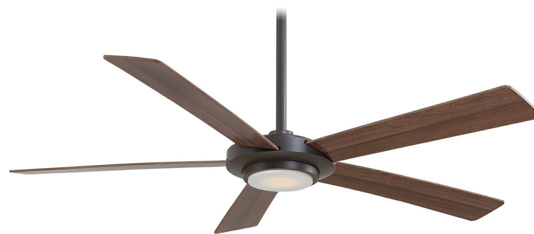
Shown with Reversible Dark Walnut Blades

Item # F745-ORB Product Family Name: Sabot Category: INTERIOR FAN Certification 4000048 Patents: U.S. Patent(s): D795,412; D804,646; Add'l U.S. Patent(s) Pending Notes: UPC Code: 706411052637 Finish: Oil Rubbed Bronze Category Type: Ceiling Fan