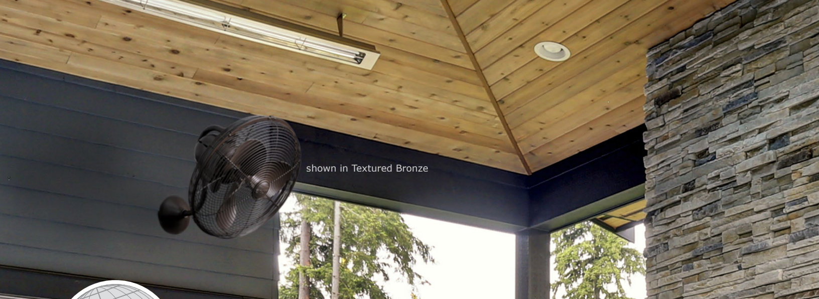
shown in Textured Bronze