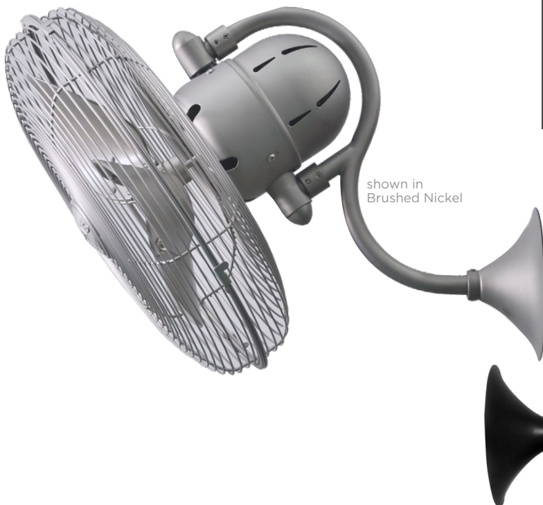
shown in Brushed Nickel