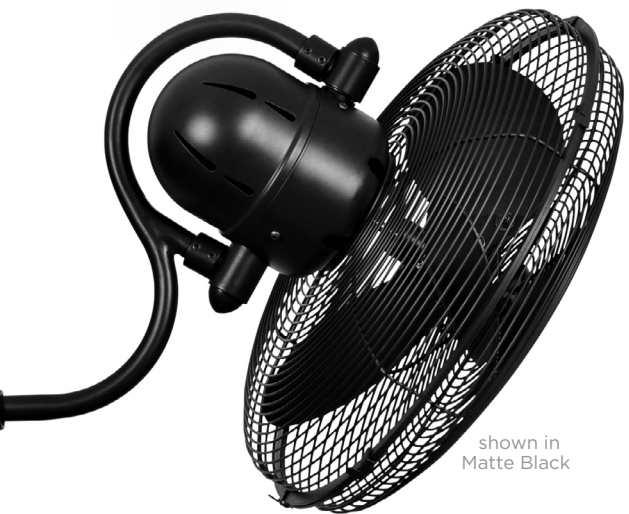
shown in Matte Black