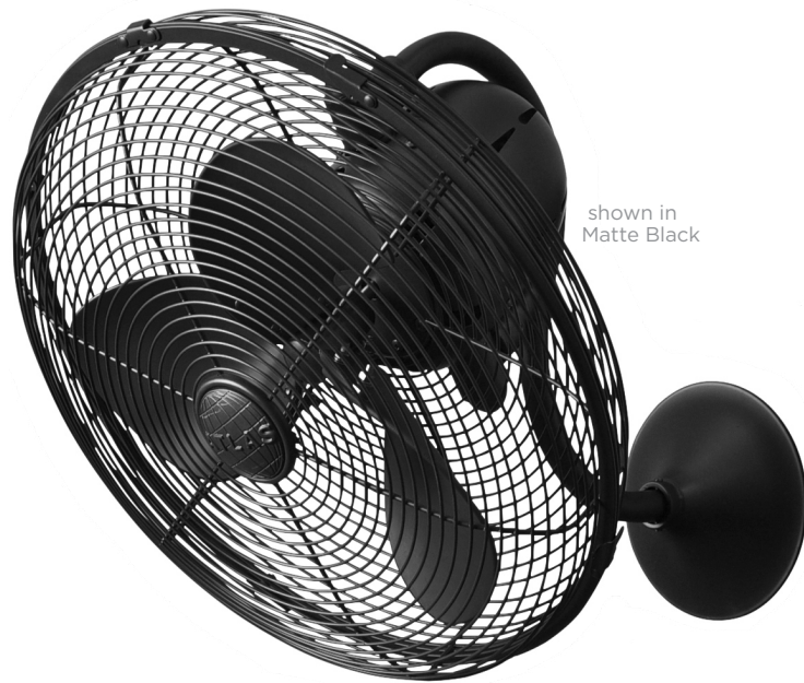
shown in Matte Black