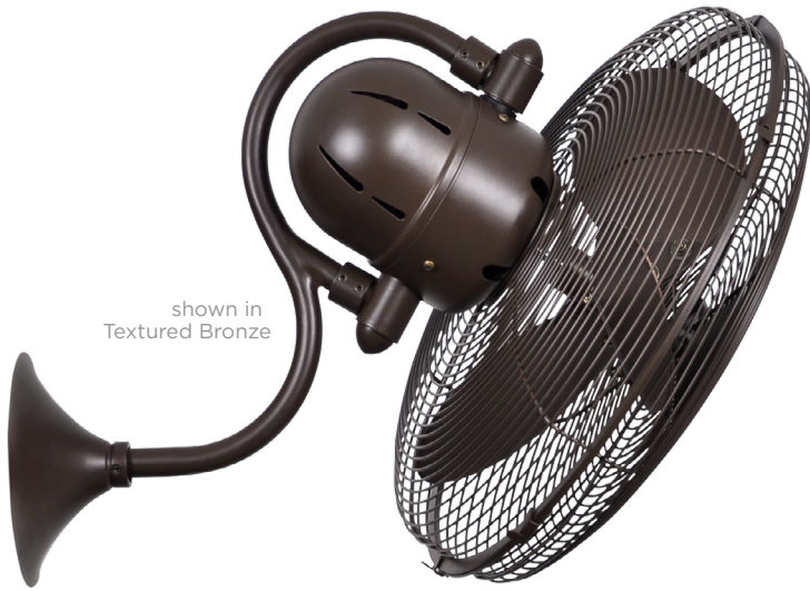
shown in Textured Bronze